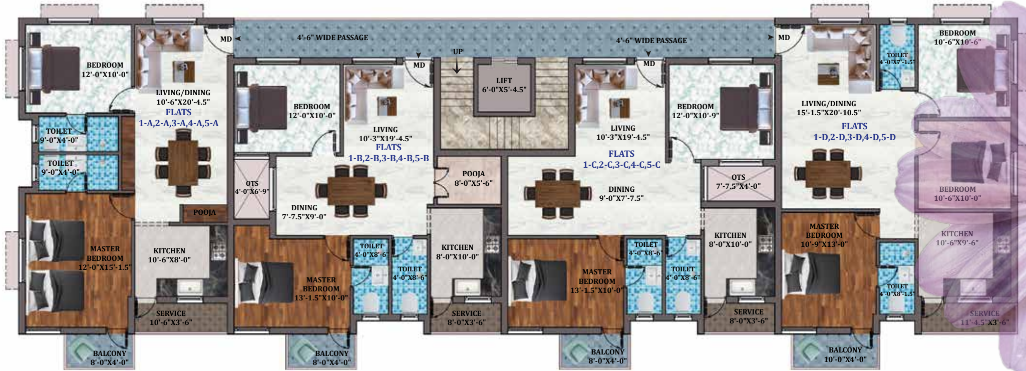
1st, 2nd, 3rd, 4th & 5th Floors